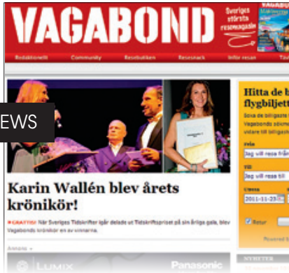
Fresh travel news every day!

Vagabond.se is one of Sweden's most extensive travel sites, for people who are about to travel, dream about travelling, or are travelling!